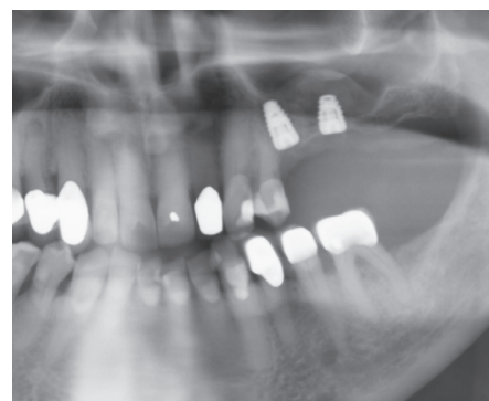
Fig. 4: PROGRESSIVE-LINE implant placed in posterior maxilla with simultaneous sinus lift

CONELOG implants are available with two different outer macro-designs: SCREW-LINE and PROGRESSIVE-LINE. The PROGRESSIVE-LINE implants have a conically shaped apical area and buttress threads to develop high initial stability. In the coronal area, a crestal anchoring thread gives support for optimal hold with limited bone height, e.g. in sinus lift procedures (Fig. 4).