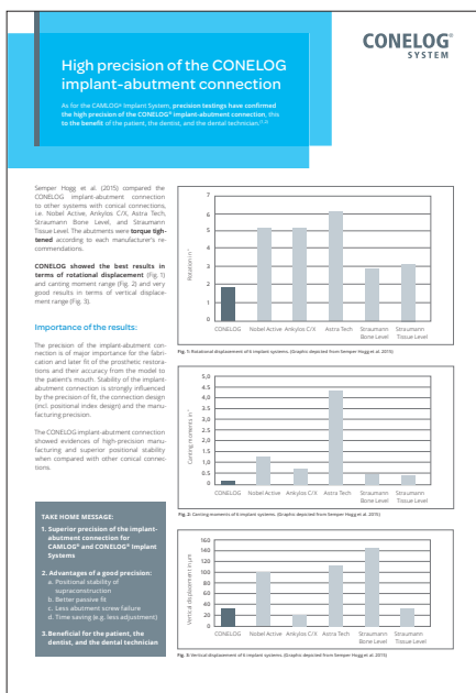
Fig. 2: Precision of different conical connections: See White paper X.J7777.09/2020.

The solid documentation of the CONELOG implant system is based on scientific evidence. This is an important contribution to Camlog's success story. The long-term data of the Promote surface, the use of platform switching, the positioning, and the stability of the implant-abutment connection are key factors contributing to the excellent performance of CONELOG implants in clinical practice. Continuous developments of the system satisfying modern treatment options are going hand in hand with clinical evidence.